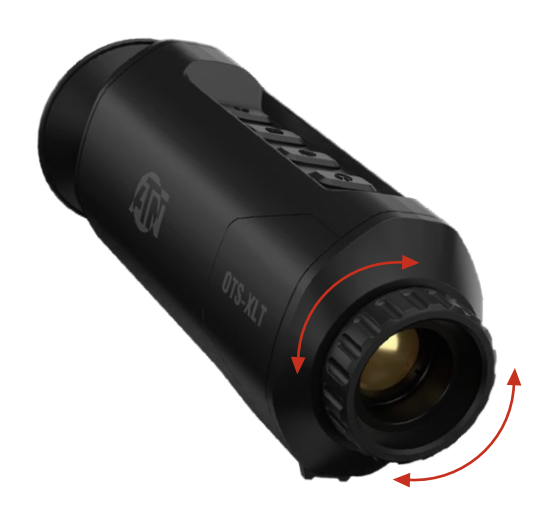
Adjust Objective Lens

Slightly rotate the focus wheel to focus the objective lens.