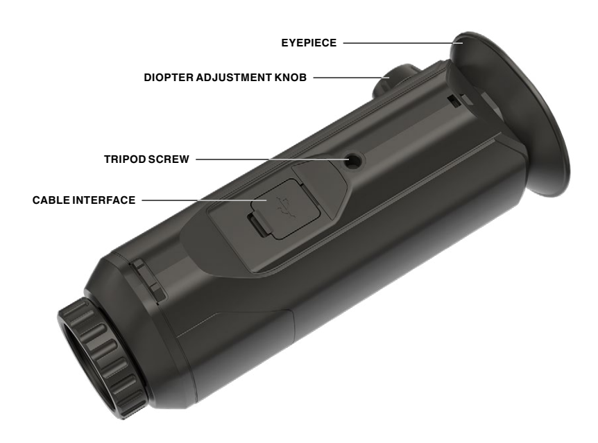
Overview of Interfaces