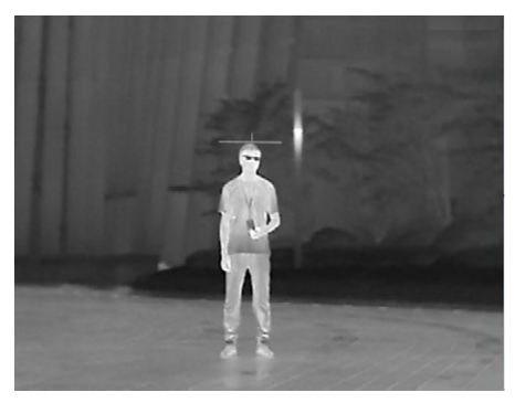
Set the Top Edge of the Target

The cursor blinks on the top edge of the target.