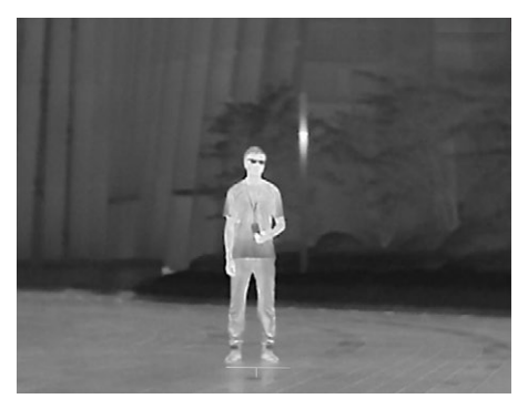
Set the Edge of Target Bottom

4. Align the center of bottom mark with the edge of target bottom. Press