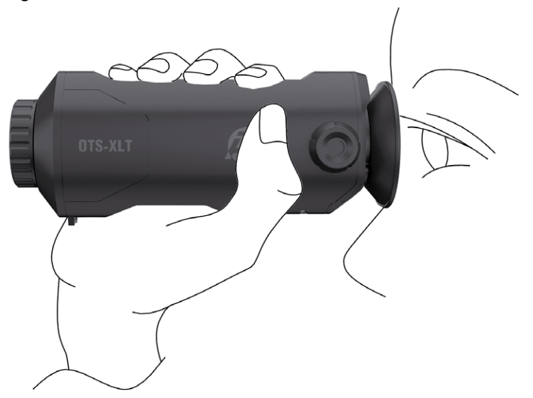
View the Target

When adjusting diopter, DO NOT touch the surface of lens to avoid smearing the lens.